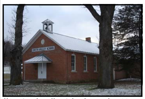
#1—Smith Valley School* (Medary Town Hall), 1887, 4130 Smith Valley Road, Town of Medary. This one room schoolhouse was built in 1887, and was used as a school until 1977. This building is now used as a one room school museum.