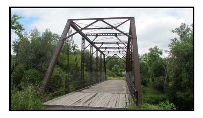
#4 –Waterloo Iron Bridge*, 1911, Town of Hamilton. This bridge spans the La Crosse River on Old County Road B near West Salem. This bridge was built to replace late 19th century bridges that were flooded out. The bridge has been closed to vehicular traffic for almost 25 years.