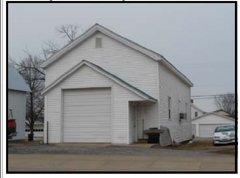
#3—Welsh Calvinist Church, 1859, 308 Commercial St, Bangor. This mid 19th century building reflects the rich history of the Welsh in the area.